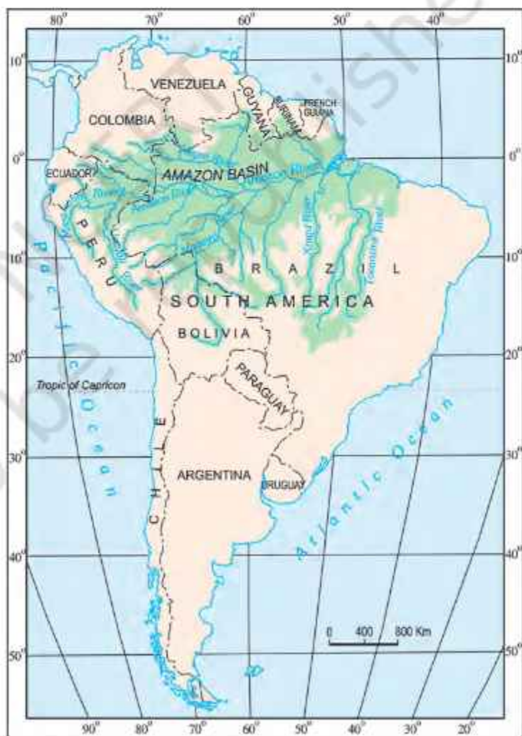
Fig. 6.2: The Amazon Basin in South America

Name the countries of the basin through which the equator passes.