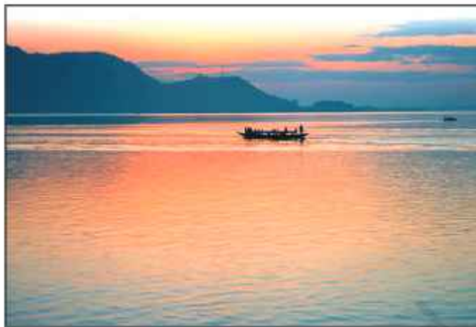
Fig. 6.7 Brahmaputra river

The tributaries of rivers Ganga and Brahmaputra together form the Ganga-Brahmaputra basin in the Indian subcontinent (Fig. 6.8). The basin lies in the sub-tropical region that is situated between 10^{\circ}\text{N} to 30^{\circ}\text{N} latitudes. The tributaries of the River Ganga like the Ghaghra, the Son, the Chambal, the Gandak, the Kosi and the tributaries of Brahmaputra drain it. Look at the atlas and find names of some tributaries of the River Brahmaputra.