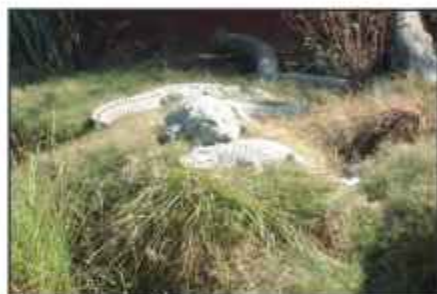
Fig. 6.12 : Crocodiles