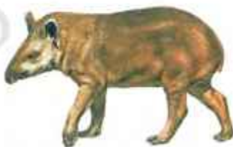
Fig. 6.5 : Tapir

The rainforest is rich in fauna. Birds such as toucans (Fig. 6.4), humming birds, macaw with their brilliantly coloured plumage, oversized bills for eating make them different from birds we commonly see in India. These birds also make loud sounds in the forests. Animals like monkeys, sloth and ant-eating tapirs are found here (Fig. 6.5). Various species of reptiles and snakes also thrive in these jungles. Crocodiles, snakes, pythons abound. Anaconda and boa constrictor are some of the species. Besides, the basin is home to thousands of species of insects. Several species of fishes including the flesh-eating Piranha fish is also found in the river. This basin is thus extraordinarily rich in the variety of life found there.