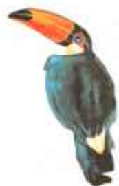
Fig. 6.4 : Toucans

The rainforest is rich in fauna. Birds such as toucans (Fig. 6.4), humming birds, macaw with their brilliantly coloured plumage, oversized bills for eating make them different from birds we commonly see in India. These birds also make loud sounds in the forests. Animals like monkeys, sloth and ant-eating tapirs are found here (Fig. 6.5). Various species of reptiles and snakes also thrive in these jungles. Crocodiles, snakes, pythons abound. Anaconda and boa constrictor are some of the species. Besides, the basin is home to thousands of species of insects. Several species of fishes including the flesh-eating Piranha fish is also found in the river. This basin is thus extraordinarily rich in the variety of life found there.