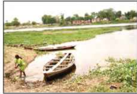
A Polluted Lake

to sell in the market. They have even begun supply to the neighbouring town. The community is living in harmony with nature. As long as the pollutants from nearby towns do not find their way into the lake waters, the fish cultivation will not face any threat.