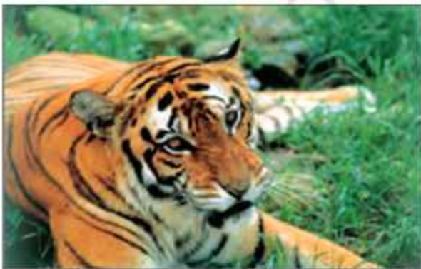
Fig. 6.14: Tiger in Manas Wildlife sanctuary

All the four ways of transport are well developed in the Ganga-Brahmaputra basin. In the plain areas the roadways and railways transport the people from one place to another. The waterways, is an effective means of transport particularly along the rivers. Kolkata is an important port on the River Hooghly. The plain area also has a large number of airports.