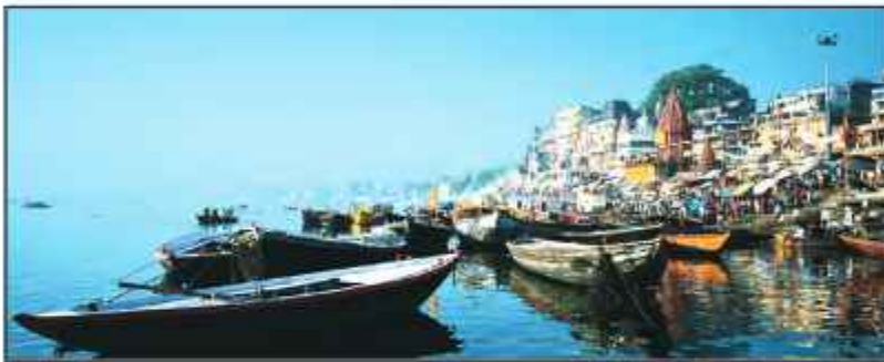
Fig. 6.13: Varanasi along the River Ganga