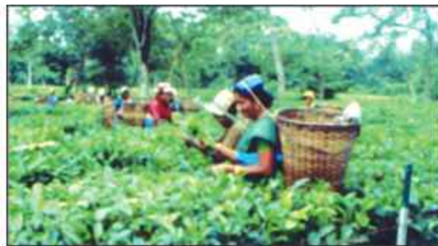
Fig. 6.10 : Tea Garden in Assam