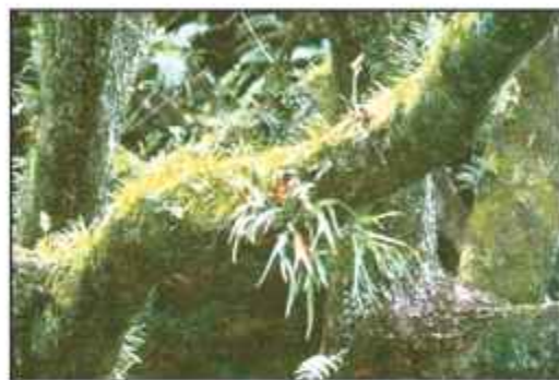
Fig. 6.3 : The Amazon Forest

As it rains heavily in this region, thick forests grow (Fig. 6.3). The forests are in fact so thick that the dense "roof" created by leaves and branches does not allow the sunlight to reach the ground. The ground remains dark and damp. Only shade tolerant vegetation may grow here. Orchids, bromeliads grow as plant parasites.