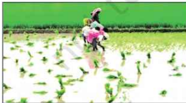
Fig. 6.9 : Paddy Cultivation

The vegetation cover of the area varies according to the type of landforms. In the Ganga and Brahmaputra plain tropical deciduous trees grow, along with teak, sal and peepal. Thick bamboo groves are common in the Brahmaputra plain. The delta area is covered with the