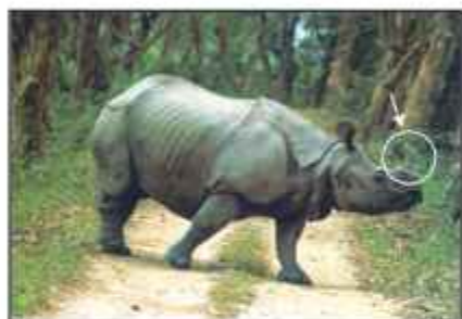
Fig. 6.11 : One horned rhinoceros

There is a variety of wildlife in the basin. Elephants, tigers, deer and monkeys are common. The one-horned rhinoceros is found in the Brahmaputra plain. In the delta area, Bengal tiger and crocodiles are found. Aquatic life abounds in the fresh river waters, the lakes and the Bay of Bengal Sea. The most popular varieties of the fish are the rohu, catla and hilsa. Fish and rice is the staple diet of the people living in the area.