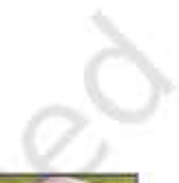
a, you can some from e from hot ne", observ